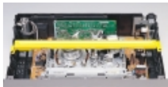
Color model shown here

A newly designed centre beam strengthens the chassis structure.